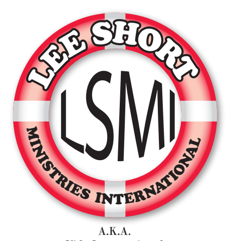
A.K.A. Vida Internacional