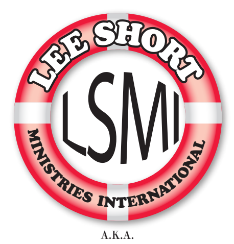
A.K.A. Vida Internacional