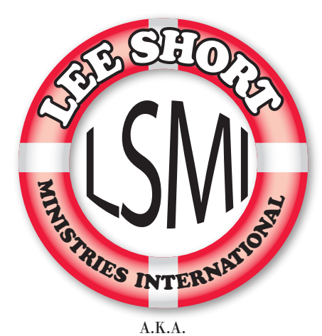
A.K.A. Vida Internacional