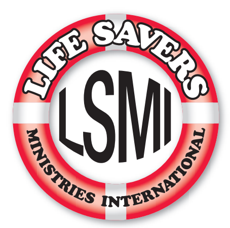
A.K.A. Lee Short Ministries International