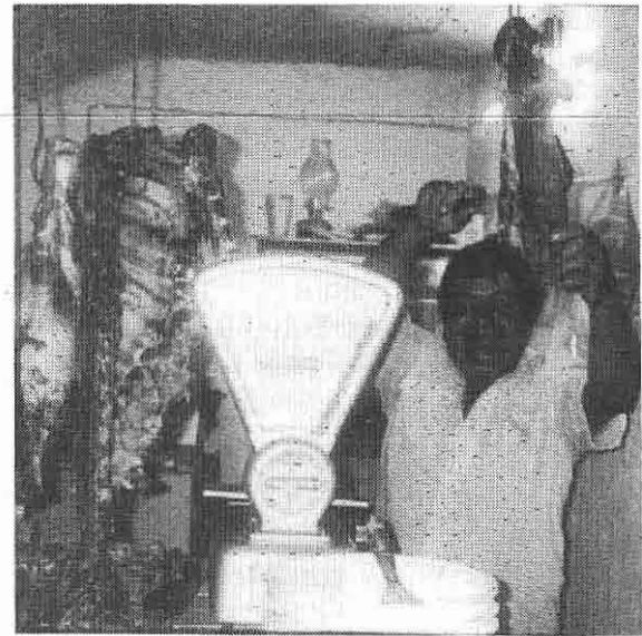
SERVICE WITH A SMILE AT THE MEAT MARKET

It's time to get the fresh vegetables and fruit, followed by a visit to one of the little stores in the street for paper products and canned goods. Sometimes they have what I need and sometimes they don't. I visit several of these stores before I complete my purchases, then it's back up the hill and home (hopefully by car). Sometimes I wish I could just go to the supermarket, but I'm glad to be in Mexico doing what God has called me to do. Thank you for making that possible.