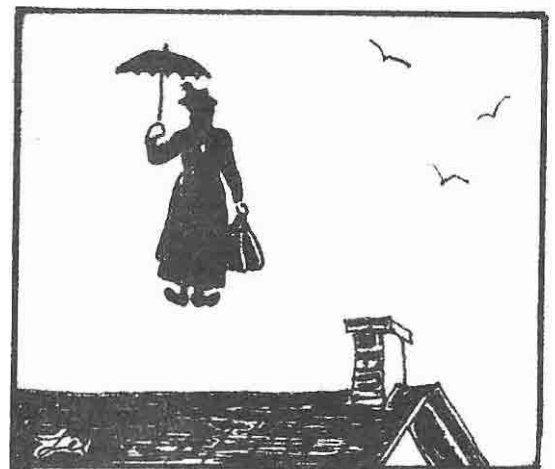
GONE WITH THE WIND ?