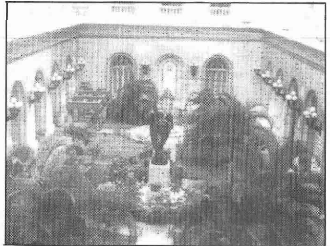
Lucifer in Cuba's Capital Building

Suddenly we turned a corner and gazed through a window into a lush tropical garden in the center of the Capitol. We could not believe what our eyes were seeing or what our ears were hearing as our guide began to tell us about the history of the statue of . . . Lucifer!