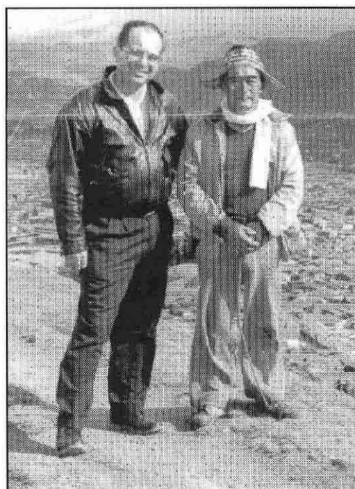
Indian peasants living harsh lives on the outskirts of Cusco.