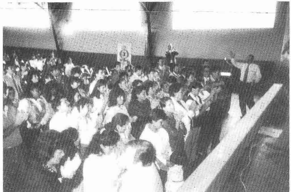
Ecuadoreans responding to Lee's altar call