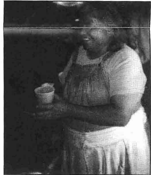
Serving up lunch.