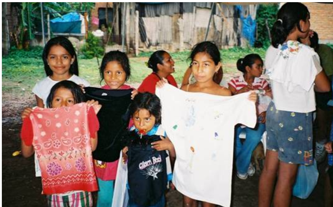
Many children living at the dump received clothing.