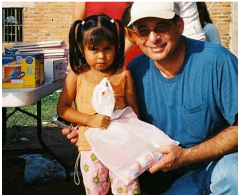
School supplies for 100 children.

Puerto Vallarta, Mexico- After successfully finding a one bedroom apartment, our focus was fixed on ministry. The place that the Lord laid on our hearts was the municipal garbage dump where approximately 80 families live on top of the trash heap. They migrate in their makeshift habitations constructed out of garbage to the fresh picking areas where new landfill has opened up. There are children born on the dump that do not know any other life than picking through garbage; scavenging to survive. The sad fact is that ten thousand people pick through the dump when they are laid off during the tourist slow season. The same people that are cooks, waiters, bottle washers, hotel maids, receptionists, bus boys, etc, pick the dump to survive. I believe that you and I can make a difference. I believe that we can minister to the poor; body, soul, and spirit. We chose the name " Bread of Life ", ("Pan de Vida" in Spanish) for this ministry.