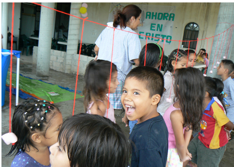
New Life in Christ Now! Our VBS storing God's word in their hearts...