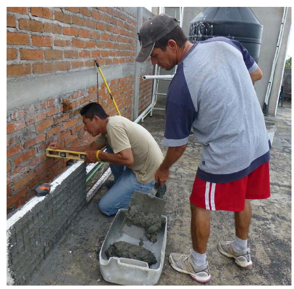
Christian encouragement is key to any recovery