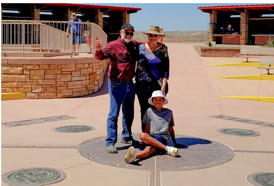
At “Four Corners” on the Navajo reservation where Arizona, Colorado, Nevada and Utah meet.