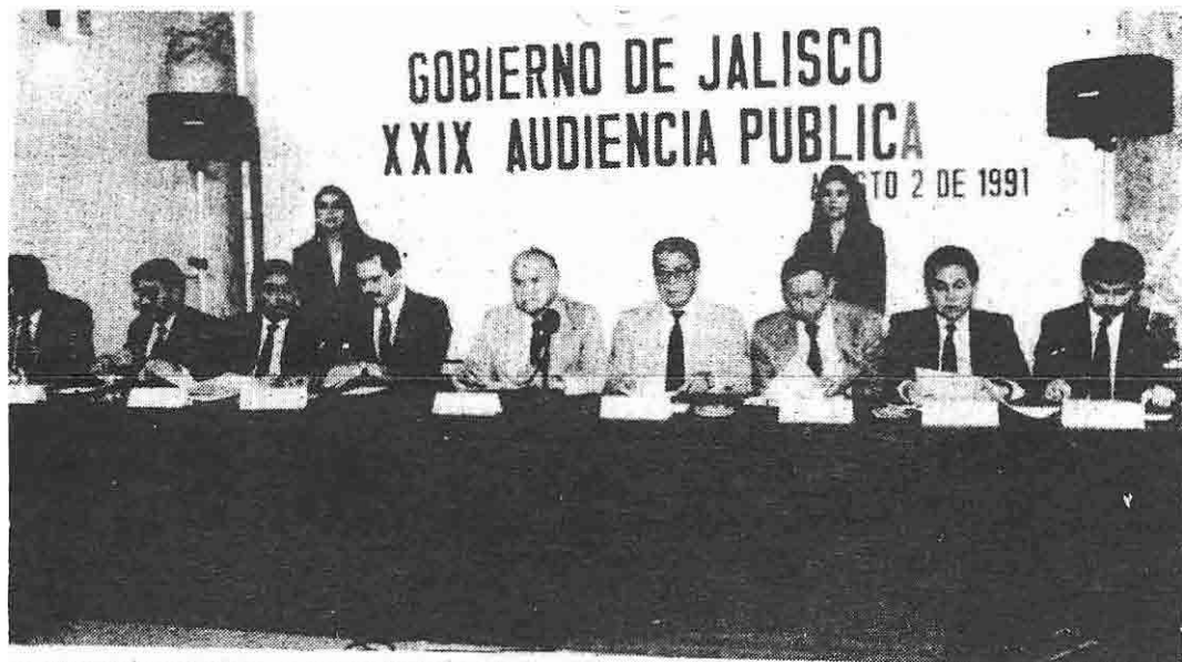
AGILIZAR JUICIOS civiles rezagados desde hace cuatro años por la posesión de terrenos urbanos y severa investigación a las instancias catastrales, ordenó el Gobernador del Estado, licenciado Guillermo Cosío Vidaurri, luego de escuchar las denuncias presentadas por vecinos de Jocotepec, durante la pasada XXIX audiencia pública del Jefe del Ejecutivo.

Photo from the DIARIO DE GUADALAJARA, Monday August 5, 1991