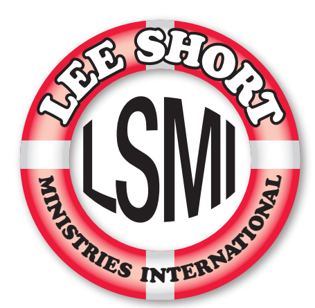
A.K.A. Vida Internacional