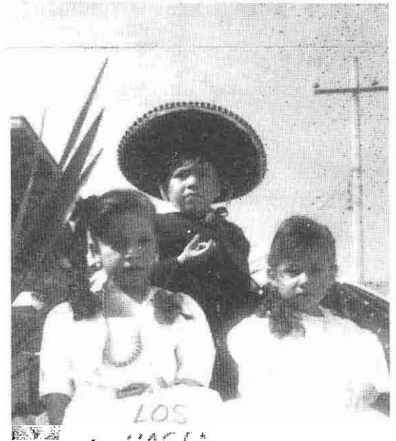
Children in traditional costume