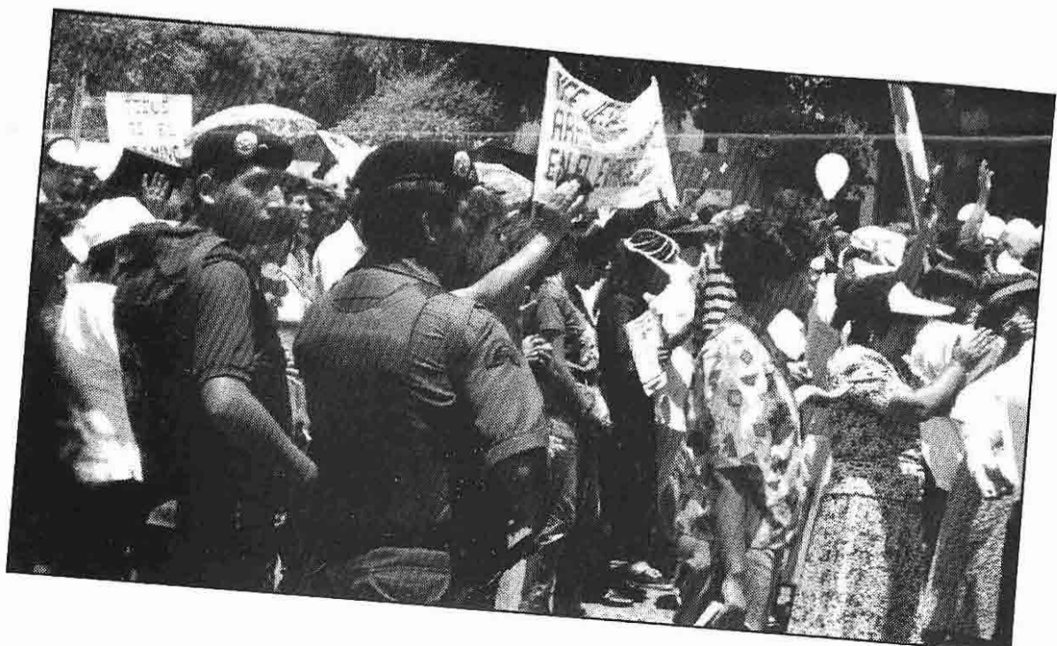
Military personnel observing: The Colonel In charge of the crisis is a Christian.