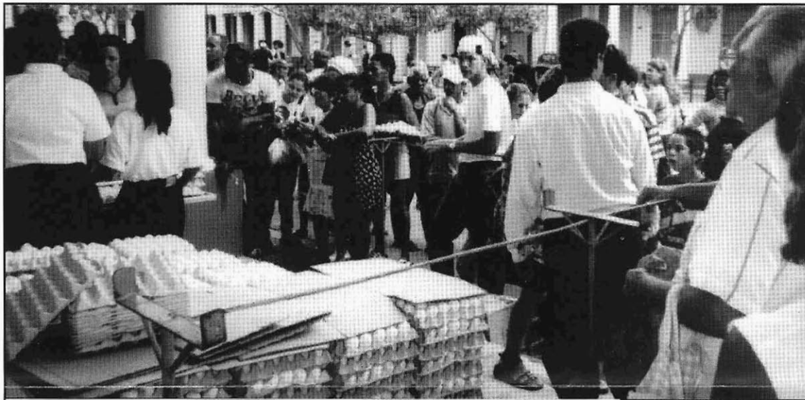
A picture of life in Cuba: Crowds of People waiting to receive their ration of eggs. Below: Modern transportation in Cuba