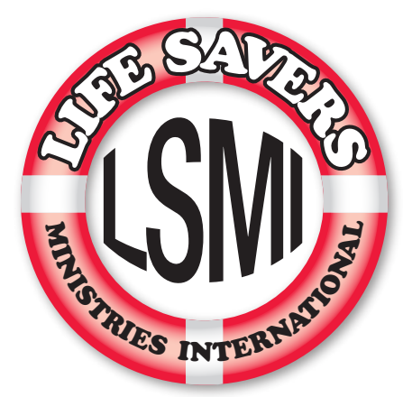
A.K.A. Lee Short Ministries International