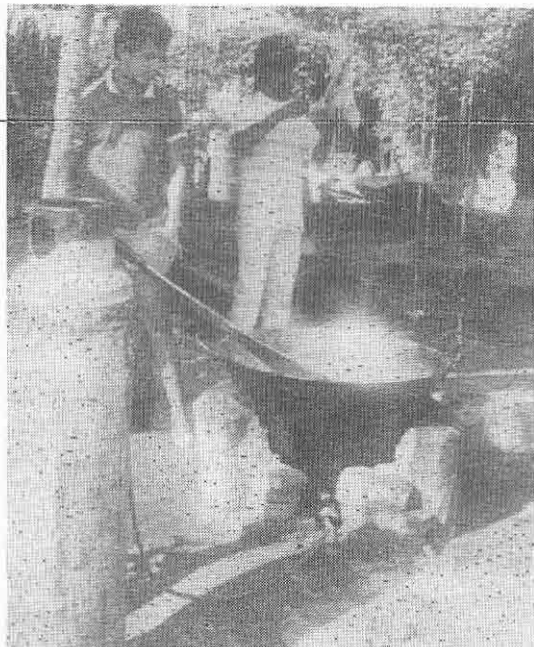
Pig Parts: innards & ears