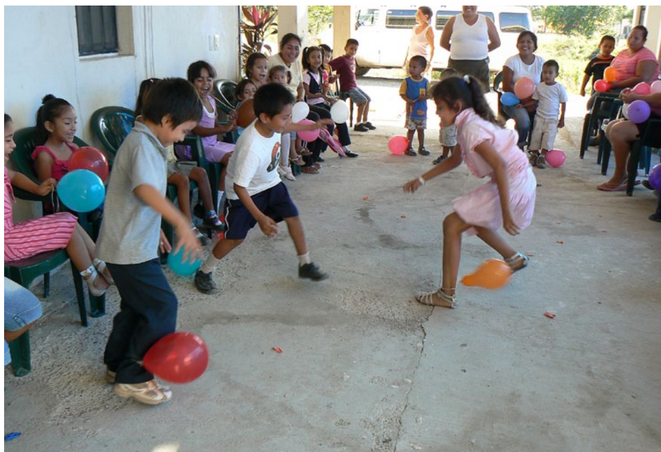
Children playing "Dance of the Roosters" at Christmas.