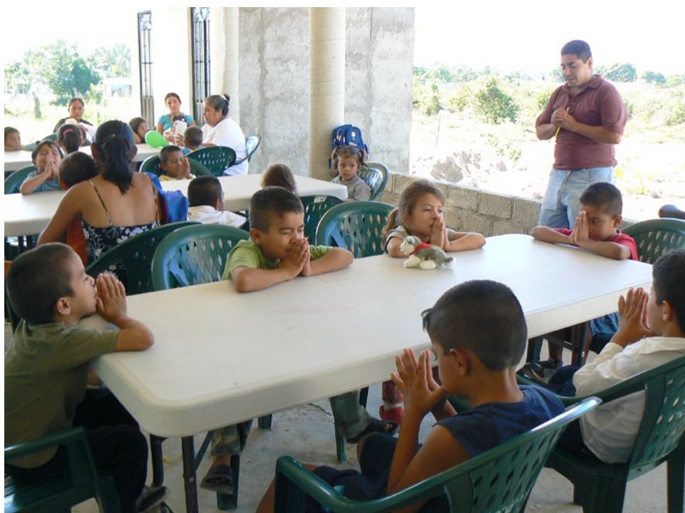
Children praying before they eat.