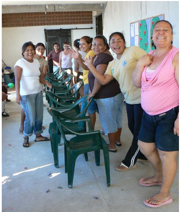
Moms playing musical chairs at Christmas