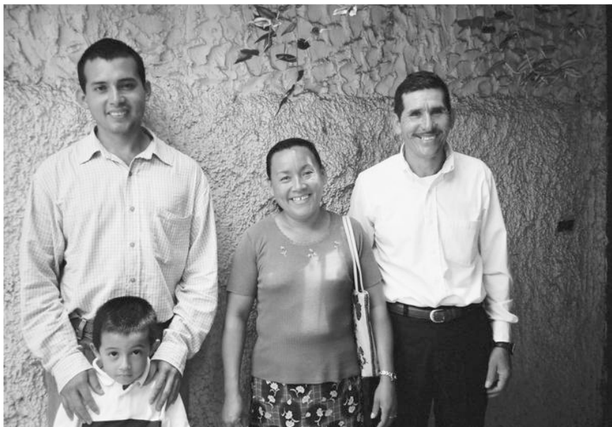
These students repair streets for a living, and we're training them to restore broken lives.