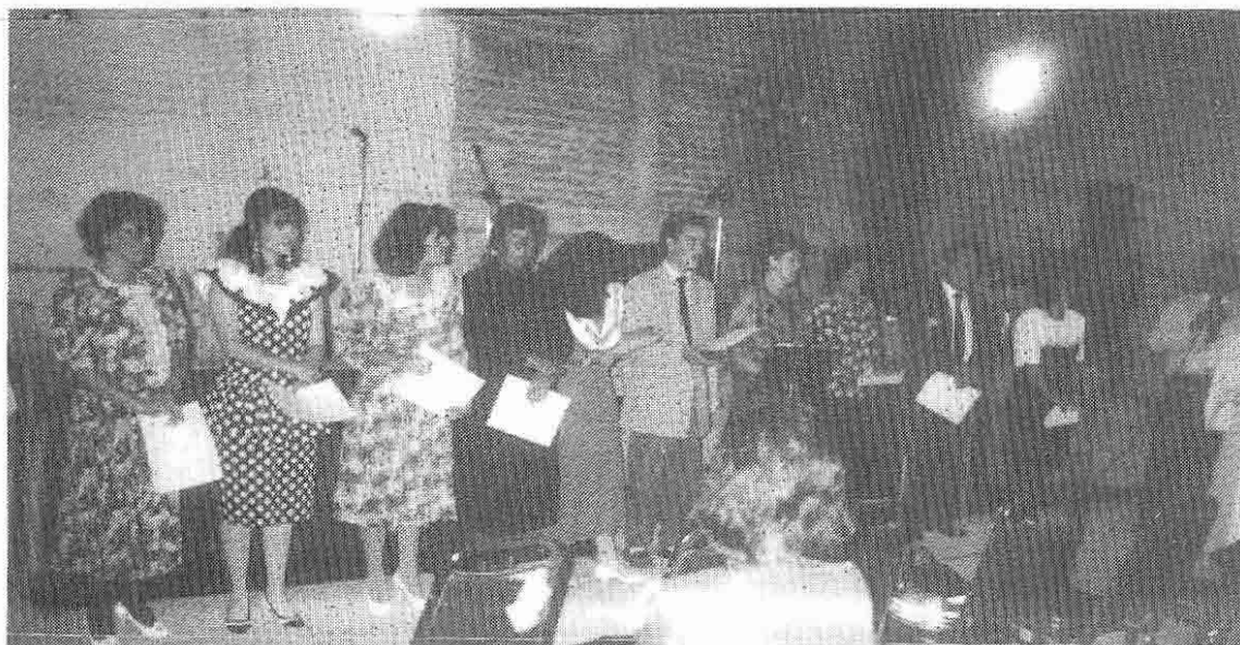
Graduates with their certificates in hand.

Short Apdo 718 c.p. 45900, Chapala Jalisco, Mexico Phone: 011-52-376-3-07-66