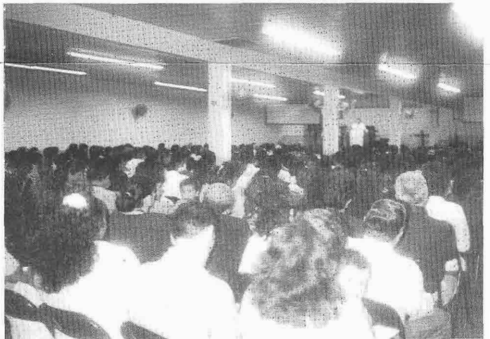
Lee preaching in Tegucigalpa.