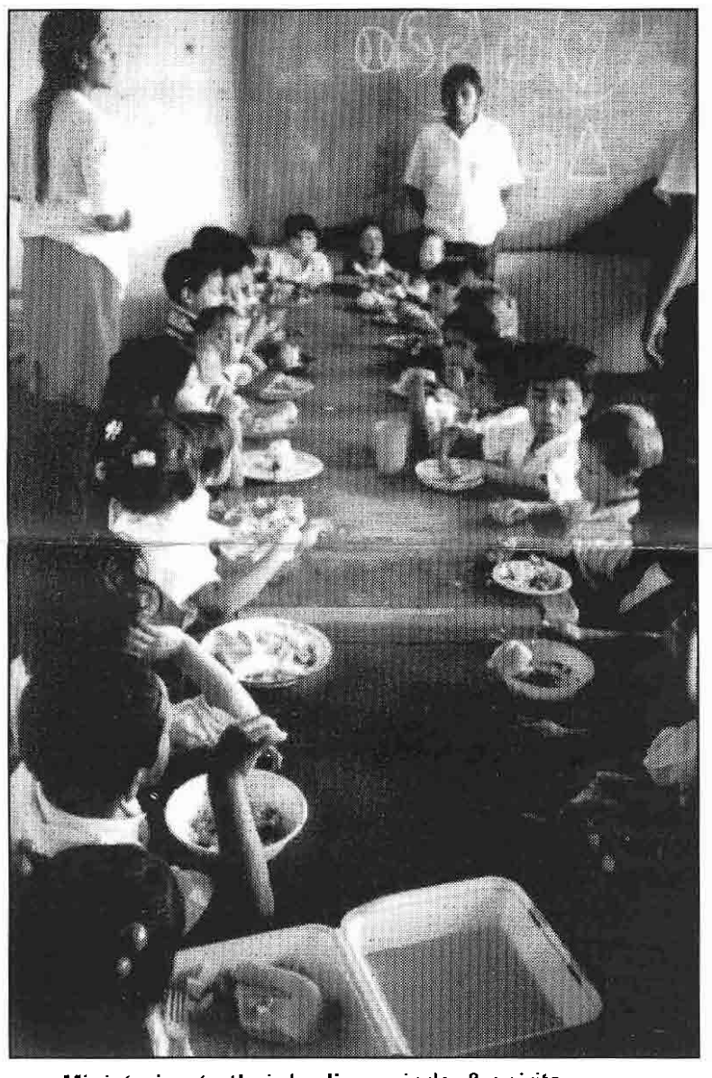
Ministering to their bodies, minds, & spirits.

We sponsored an event feeding five hundred kids providing games and piñatas. After that, we shared the Gospel with them. We also invested in the school by buying good used clothing at wholesale so that they could resell them in their villages and help to finance the teacher's salaries. From the profits, they can buy more clothing and have an on going source of income for the schools expenses.