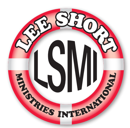
A.K.A. Vida Internacional