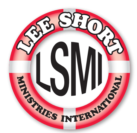
A.K.A. Vida Internacional