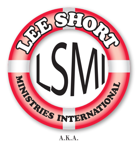
A.K.A. Vida Internacional