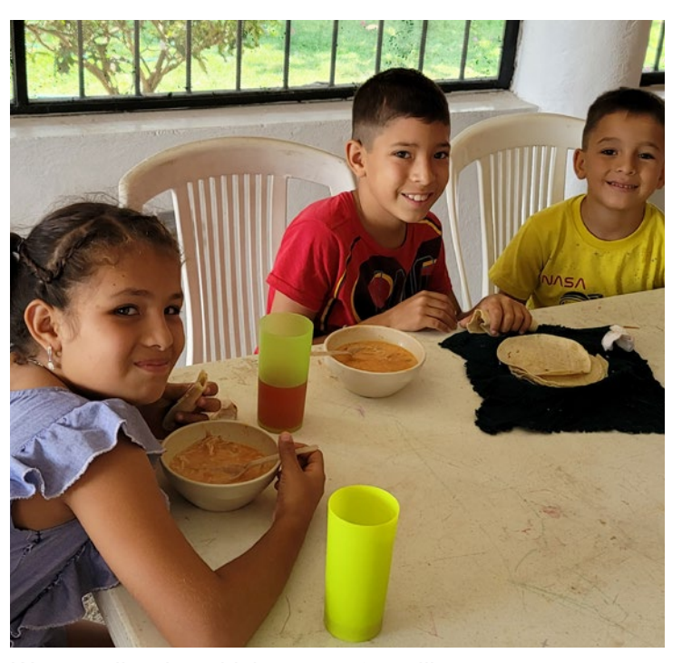
Warm smiles, hot chicken soup & tortillas