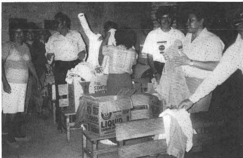
Smiles of thanks for the gift of clothes