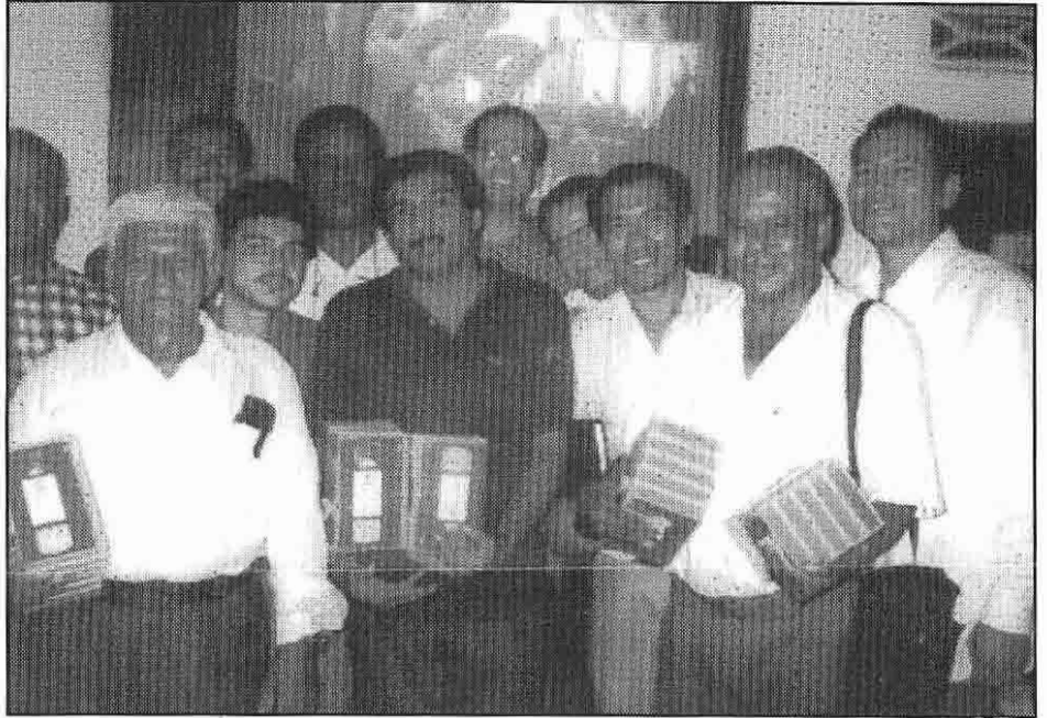
We hosted lunch & blessed these Pastors with Video Bible school Curriculum. One pastor thanked me for providing delicious nourishment both physically and spiritually.

The Lord brought ministries from around the world to minister in that place. It was harvest time in Limón and our video discipleship materials were joyfully received by the 15 pastors that we were able to bless. Thank you for sending me and our video Bible school curriculum. Your prayers & financial partnership makes this possible.