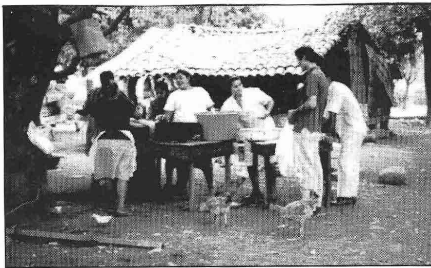
We fed them & clothed them, & shared the Bread of Life