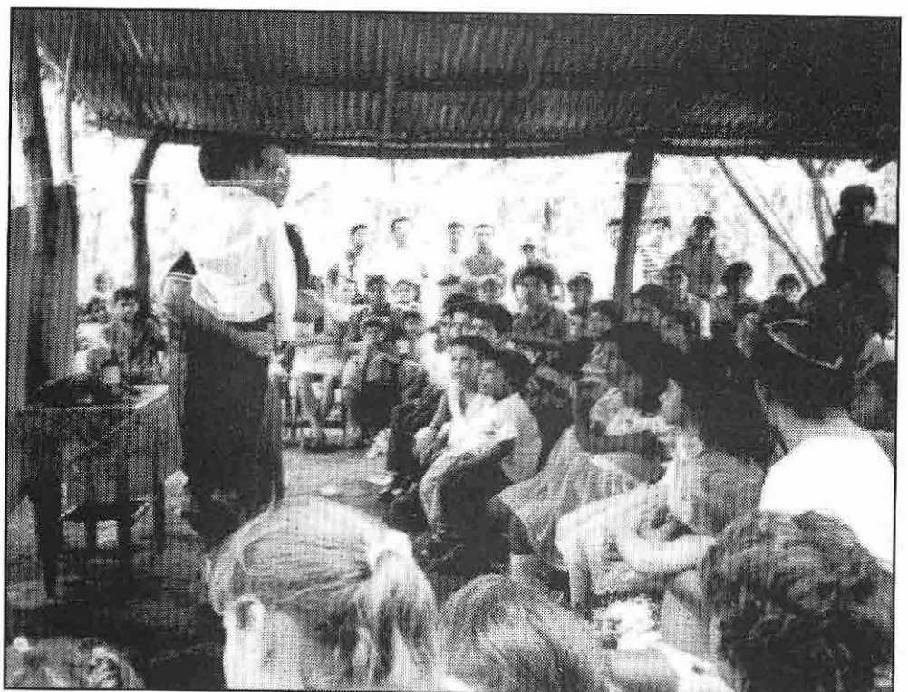
They were hungry for hope and hung on every word.