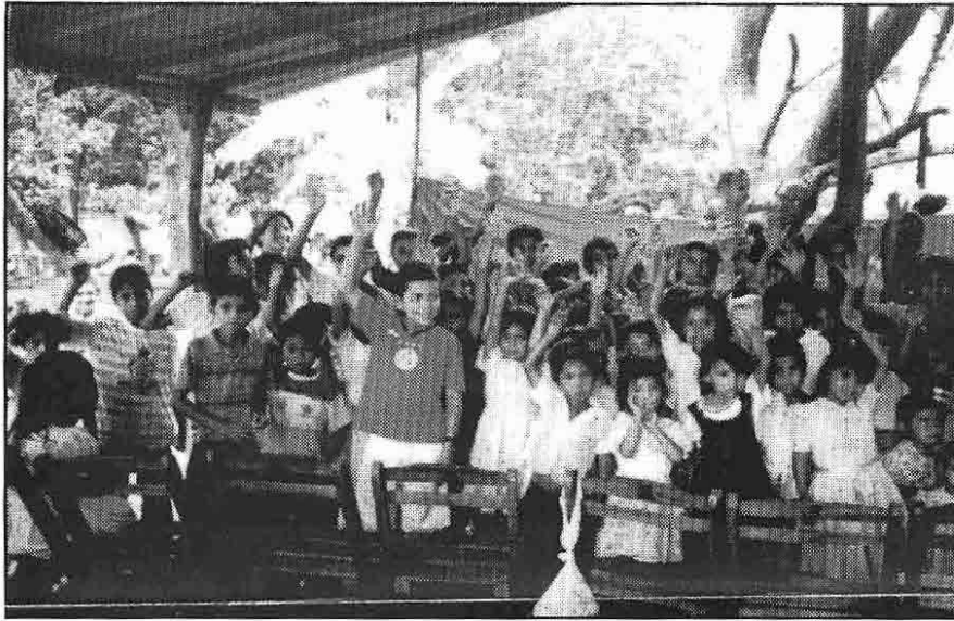
52 children accepted Christ as Savior!

I gave beyond what I had, and told the people that God loves them and cares for them, and that the food that they received today was provided for them by friends in the United States who support this ministry. I shared with them about how Jesus loved the little children and 52 little ones came forward and prayed to invite Christ into their hearts!