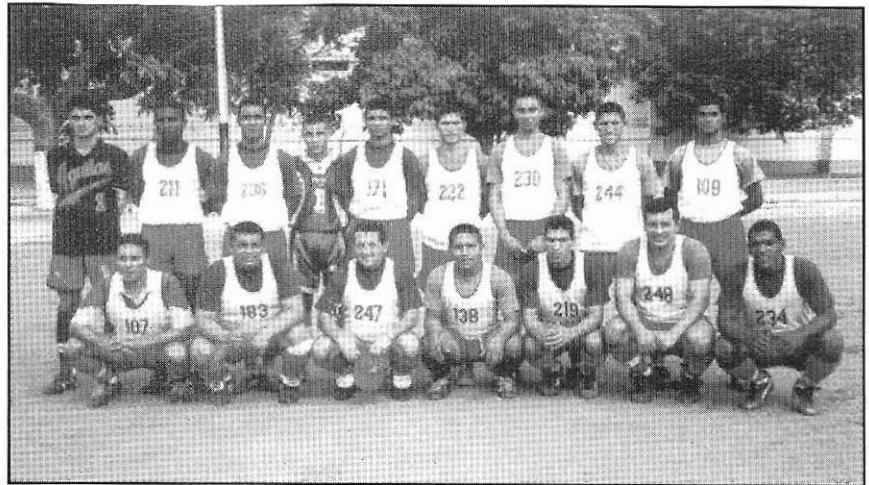
The team of soldiers that played against us