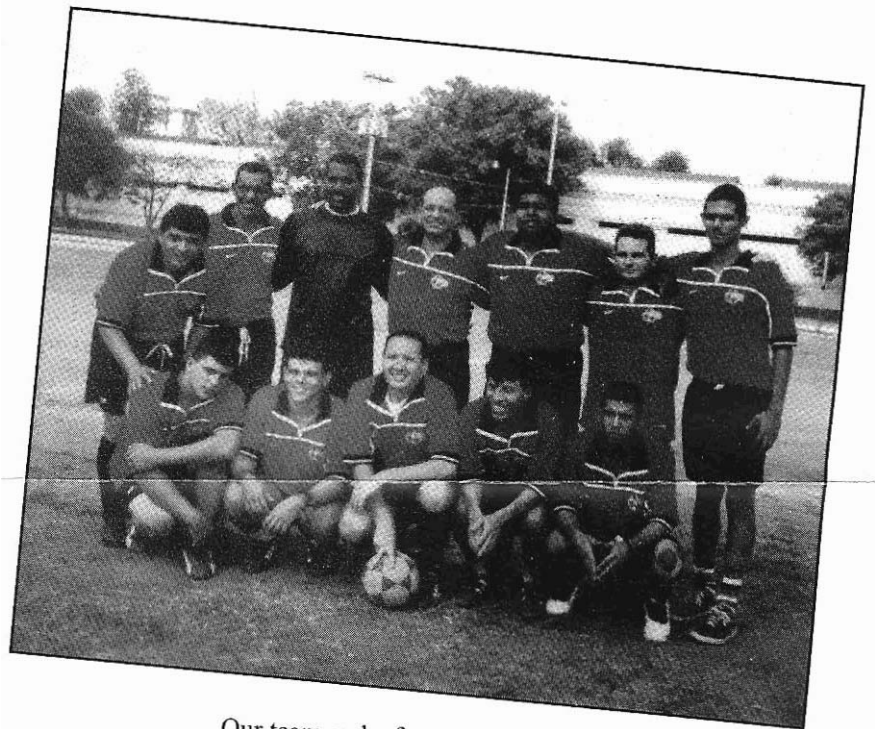
Our team and a few refugees