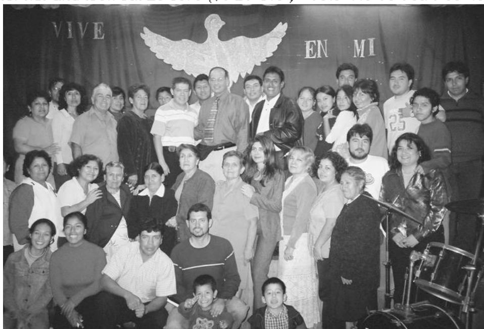
Mision Baptista Internacional, Chimbote Viejo, Peru