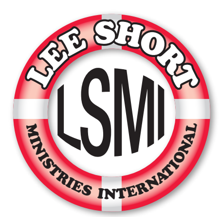
A.K.A. Vida Internacional