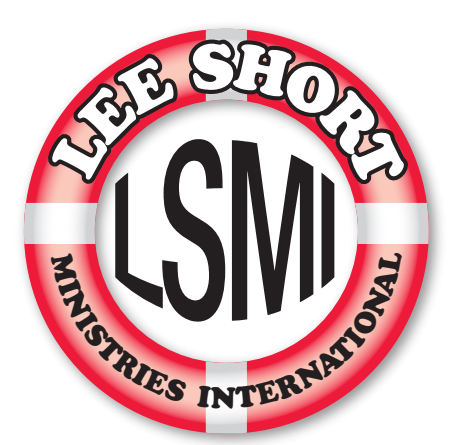
A.K.A. Vida Internacional