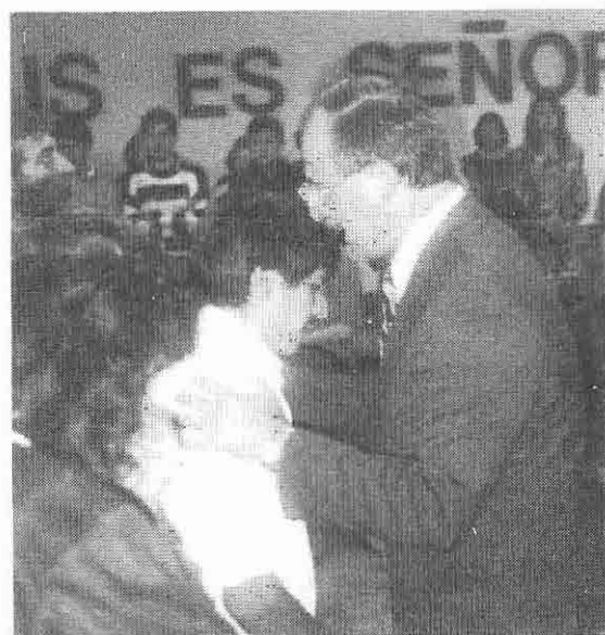
Praying to receive Christ.