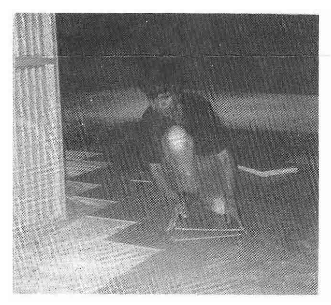
Studio floor being laid