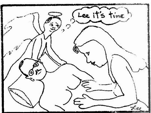
Get Back Here! You're Not Leaving Me Here Alone In this Mess.