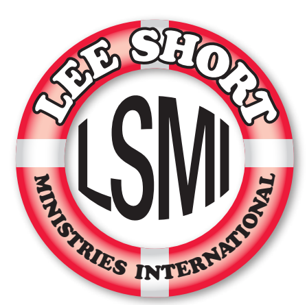
A.K.A. Vida Internacional