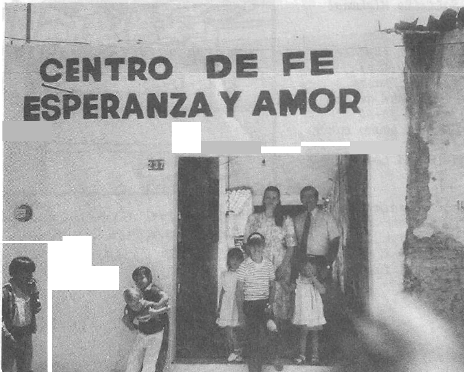
STANDING IN THE DOORWAY OF THE LOCAL CHURCH THAT WE ARE NOW A PART OF