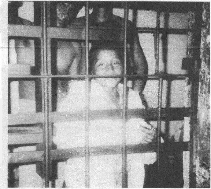
11 year old boy in jail for stealing.

The animals that I have seen there haven't committed any crimes either. They are pets of the prisoners. A two foot long green iguana (lizard) and a pigeon with clipped wings share quarters there. I guess the old sayings "misery loves company" or "hanging on by a wing and a prayer," could describe these pets' plight.