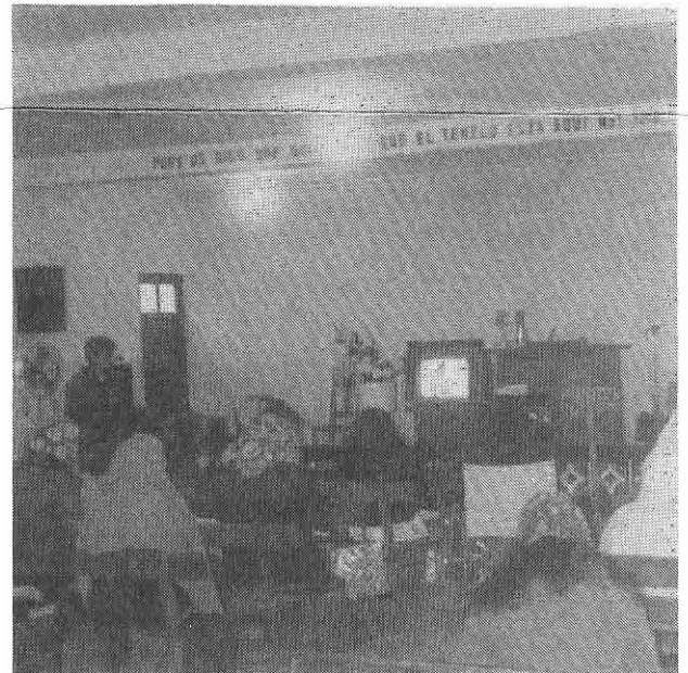
The Video Bible Institute in San Nicolas

We had the privilege of starting a Bible institute in one of these churches, training up leadership so that the work