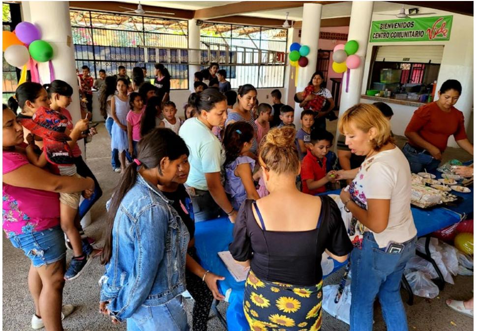
Celebrating Day of the Child.