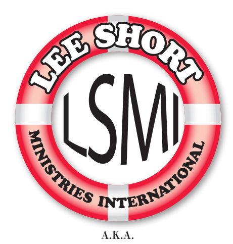
A.K.A. Vida Internacional