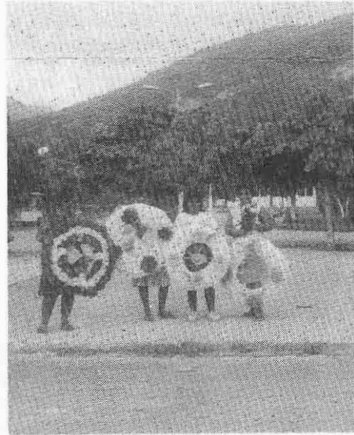
The Day of the Dead: Ladies taking flowers to the graveyard

The Bible strictly forbids us to participate in such activities. We know that for the believer to be absent from the body is to be present with the Lord. Jesus Christ did not send us into all the world to change cultures, but to teach the Truth, which will set them free from the works of darkness and superstition.