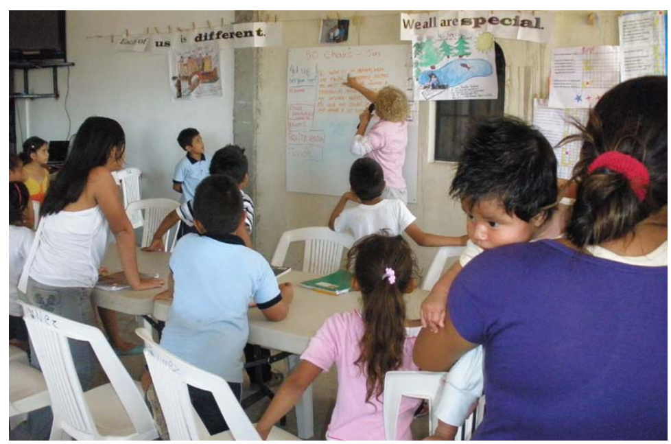
Learning the 23rd psalm in Spanish and English...

We began our Great Adventure under the cloak of darkness. Our alarm went off at 2a.m. & we crawled out of bed. I mean, we sprung to our feet like 'middle aged' minute men. Our "98" GMC Jimmy Locked & loaded and we began our Incredible Journey to our home, South of the Border. The road trip to Mexico was necessary to bring down a more reliable vehicle. We made it without needing any road side assistance. We saw a compact car that broke down out in the middle of nowhere and a Mexican Angel (Tourist roadside assistance) began to push it bumper to bumper. Before our eyes, the Angel began to rev it up. He went from 10mph to 60+ mph. This high speed road show kept us entertained as they were weaving in and out of traffic, passing slower moving vehicles. These wanna be stunt car racers even passed Federales without getting stopped. We kept our distance in case they spun out of control.