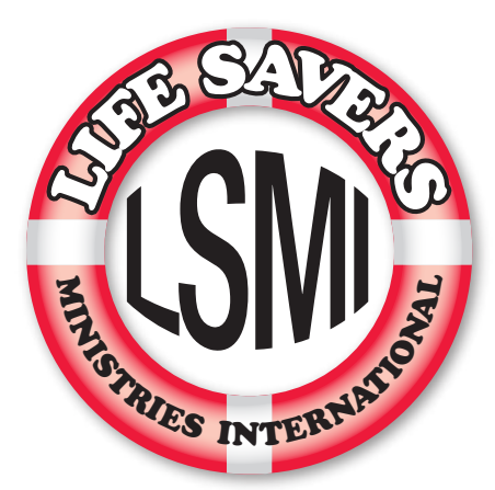
A.K.A. Lee Short Ministries International