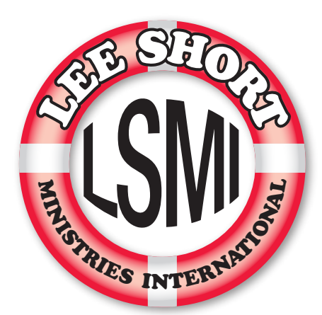
A.K.A. Vida Internacional