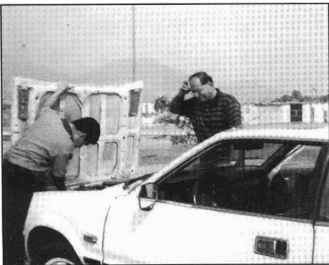
Broke down again, It's a way of life!

All contributions are tax deductible Make checks payable to L.S.M.I. (Lee Short Ministries International)