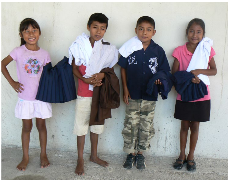
You helped these children with their school uniforms so they can go to school.

We are part of a developing rural community that is morphing into a small city. In our current condition raw sewer flows thru the muddy streets and high weeds. It is a breeding ground for mosquitoes and sickness. Meanwhile, there is development bursting out in every direction. Three miles down the road in a densely populated area a brand new Wal-Mart has just popped up. Over the next five years we will be surrounded by hundreds maybe even thousands of new neighbors.